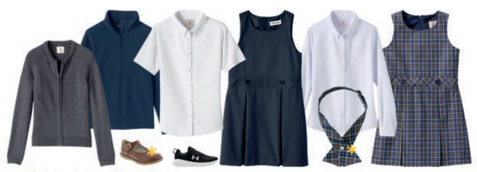
Optional - Dress Shoes & Cross-tie